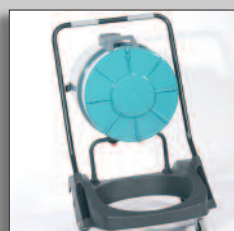
Easy tilting tank