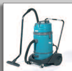
V14 large capacity with trolley