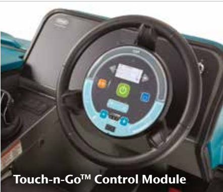
Touch-n-Go™ Control Module