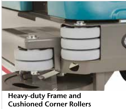
Heavy-duty Frame and Cushioned Corner Rollers

Overhead guard protects operators from falling objects.