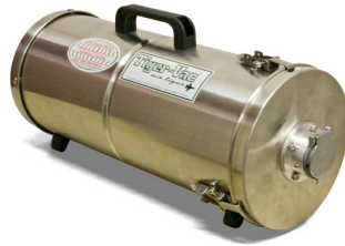
SSAT-2L (HH) AIR TIGER