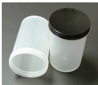
Jar for Mercury Recovery, 20 oz (540 ml) with lid - Optional