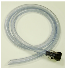
Clear Suction Hose Assembly for use with Mercury Separator - Included