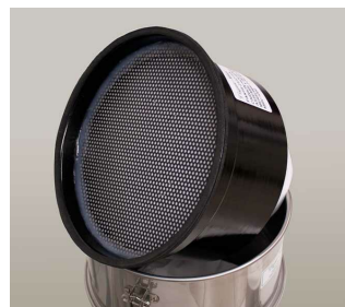
Activated Carbon Cartridge for Mercury Recovery - Included