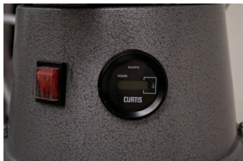
Hour Counter for MRV models - Included