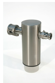
Mercury Recovery Separator with Jar - Included