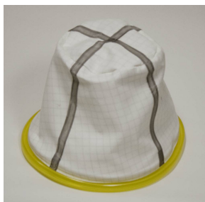
Main Cloth Filter, Static Dissipative - Included