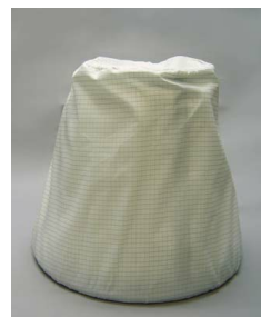
Pre-Filter, Static Dissipative - Included