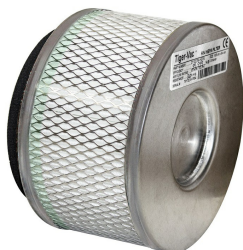
HEPA Filter - Included