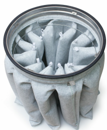
Conductive Star Shaped Filter with Cage (Not for use with HEPA Filter) - Optional