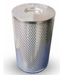
HEPA Filter - Downstream - Optional