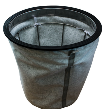
Conductive Bell Shaped Filter with Cage (For use with HEPA Filter) - Included