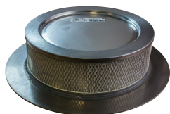
HEPA Filter - Upstream - Optional