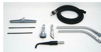
Ø1.5" (Ø38mm) Static Dissipative Tools and Accessories for 1-2 HP Models - Included