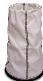
Conductive Bell Shaped Filter for 5 HP models - Included