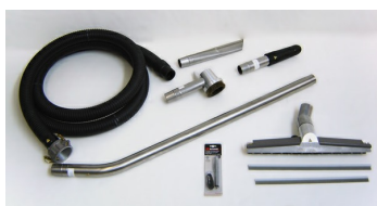
Ø2" (Ø50mm) Static Dissipative Tools for 5 HP Models - Included