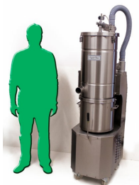
CD-2600 Next to average sized man