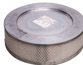
HEPA Filter - Optional