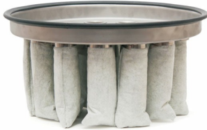
Filter Tubes Assembly for MRPFT models - Included