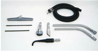
Ø1.5 (Ø38mm) Static Dissipative Tools and Accessories - Included